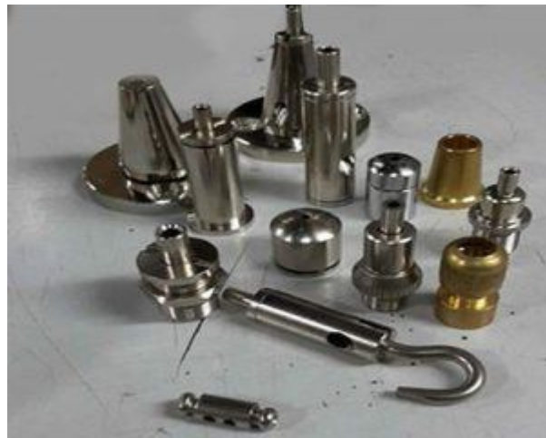
LIGHT SPARE PARTS