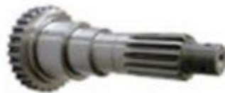
TRANSMISSION GEAR SHAFT