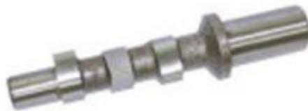
DIESEL ENGINE CAMSHAFT