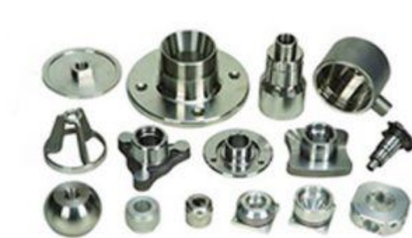
AUTOMOTIVE TURNED PARTS

We also have extensive expertise in flawlessly handling the demands of Automotive Parts that can be made available by us in different finish specifications as demanded by our customers. Featuring use of quality material during the construction stage, these manufactured parts also deliver exceptional overall performance as well as longer service life standards. Here, we make these available at competitive prices.